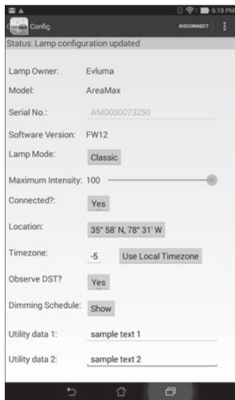
Basic: Info screen