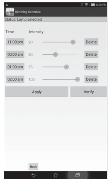
Promo & Enterprise: Dimming Schedule

Screens shots of ConnectLED v2.2 for Andriod Tablet